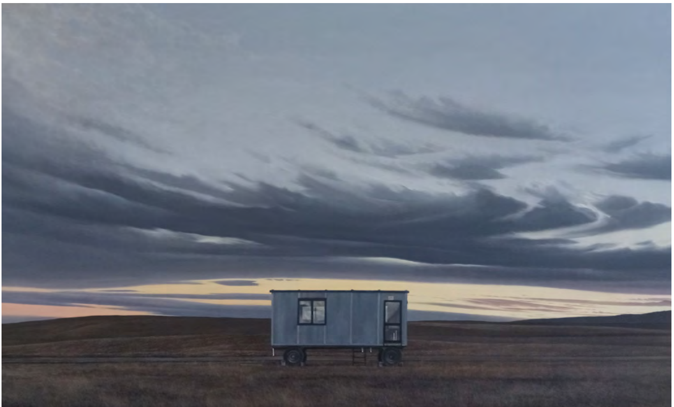
'Site Office'. Oil on Linen. 710 x 1220mm. 2023. Private Collection, Asia.

New Zealand had something so bold and beautiful. And if you can stand any more of the sickening subject, Maggie Haberman's "The Confidence Man" will tell you all you need to know about Trump.