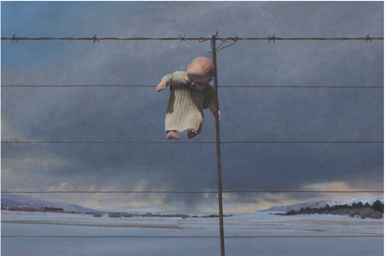
'For the Forgotten' . Oil on Linen. 660 x 1010. 2022. Personal Collection.