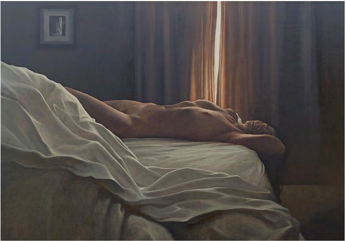
'Untitled'. Oil on Linen. 710 x 910mm. 2023. Personal Collection.