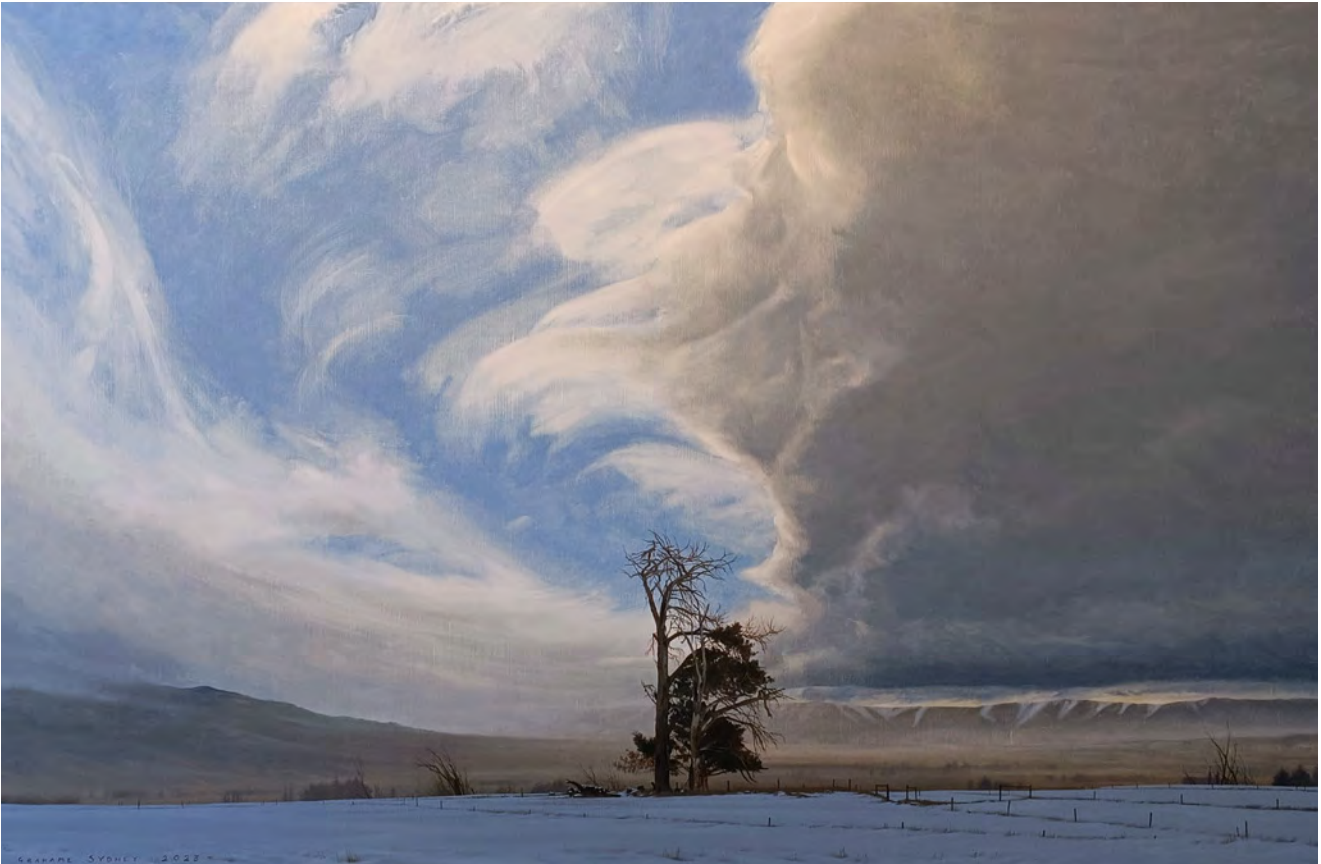
'The Last of the Snow'. Oil on Linen. 1220 x 760mm. 2023. Private Collection, Asia.