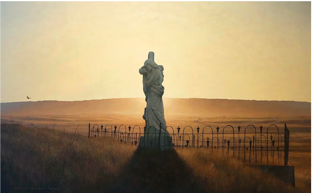
'Say Not Goodnight' . Oil on Linen. 660 x 1010. 2022. Private Collection, Asia.